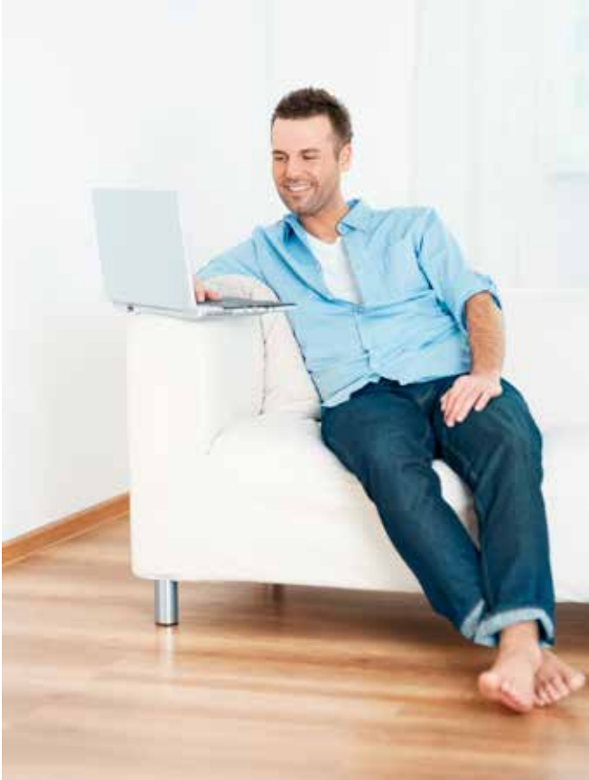
Comfort from head to toe by avoiding thermal bridges.

Welcome to the next level of thermal comfort. A luxuriously warm living space is yours from floor to ceiling, head to toe. Observe the magnificent city views bestowed and feel the comfort and warmth near the balcony. Consistent indoor floors and surfaces temperature are possible with innovative structural thermal breaks by Schöck Isokorb®. Good bye cold feet.